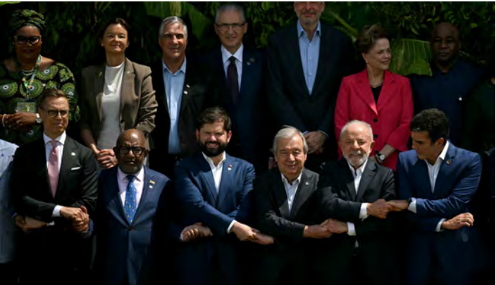
Leaders and delegation heads pose for the family photo at the Leaders Summit ahead of the COP30 UN climate conference in Belem