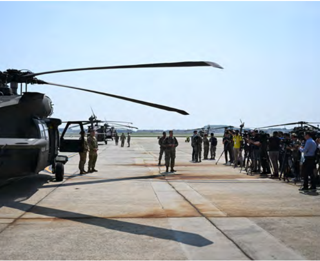
Media members (R) view an Army UH-60 Black Hawk helicopter at Joint Base Andrews, Maryland

North Korea fires unidentified ballistic missile: Seoul military ♦ North Korea fired a ballistic missile yesterday, Seoul’s military said, around a week after US President Donald Trump approved South Korea’s plan to build a nuclear-powered submarine. Analysts have said Seoul’s plan to construct one of the atomic-driven vessels would likely draw an aggressive response from Pyongyang. South Korea’s Joint Chiefs of Staff said North Korea fired an unidentified ballistic missile towards the East Sea, referring to the body of water also known as the Sea of Japan. The missile landed in the sea outside Japan’s economic waters and no damage or injuries had been reported, said Japanese Prime Minister Sanae Takaichi..