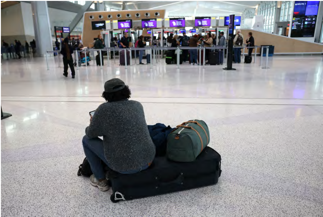
A traveler sits on his luggage as he waits at Newark Liberty International Airport in Newark, New Jersey

Hundreds of flights were canceled across the United States yesterday after the Trump administration ordered reductions to ease strain on air traffic controllers who are working without pay amid congressional paralysis on funding the US budget. Forty airports were due to slow down, including the giant hubs in Atlanta, Newark, Denver, Chicago, Houston and Los Angeles. With Republicans and Democrats in a bitter standoff over spending priorities, including over healthcare, Congress has ground to a standstill, leaving the entire federal funding spigot closed. Vast numbers of government employees, including vital airport staff, are working either without pay or are at home furloughed, waiting for the now nearly six-week crisis to end. The impact remained unclear early yesterday, with the flight reductions due to take effect gradually, starting at four percent and rising to 10 percent next week if Congress still hasn't reached a funding deal. More than 800 flights scheduled for yesterday were canceled, according to tracking website